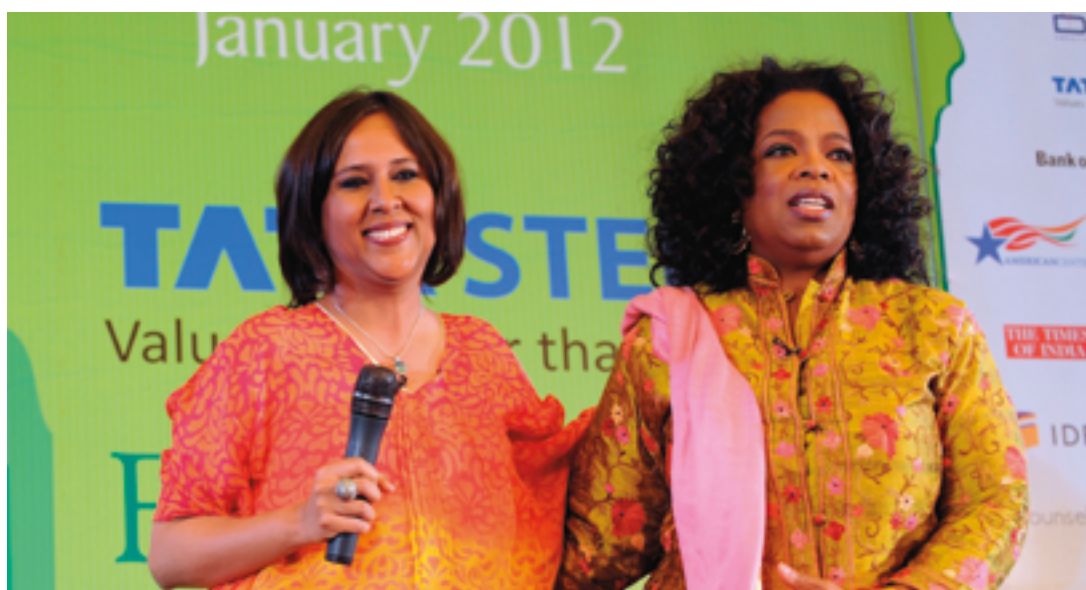
→ Television talk show host Oprah Winfrey poses with Indian Journalist Barkha Dutt during the DSC Jaipur Literature Festival in Jaipur on January 22, 2012

Aggressive comments and insults also fly around social networks. “Presstitute,” an amalgam of “press” and “prostitute,” is widely used to insult women journalists in India. “ I have been called a whore, a bitch and ‘presstitute,’ ” said Barkha Dutt , an Indian journalist who was trolled online after the publication in 2015 of “ This Unquiet Land - Stories from India’s Fault Lines ,” a book in which she describes the abuse to which she was subjected as a child and adolescent. “ My mobile number has been shared publicly on multiple online platforms urging people to send me abusive and threatening messages, ” she told the Hindustan Times , which devoted a series to cyber-harassment entitled “ Let’s talk about trolls. ”