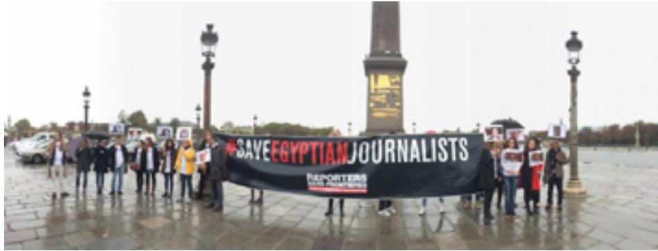
→ Demonstration of Reporters Without Borders on October 24, 2017 at the Place de la Concorde in Paris, against censorship and violence towards Egyptian journalists and medias that continues to worsen.