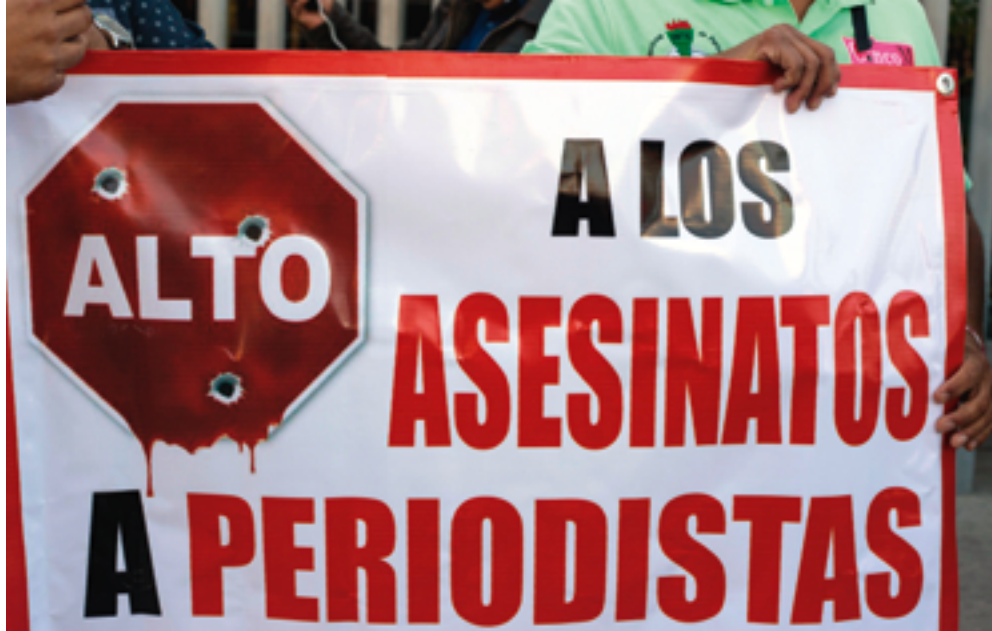
→ Demonstration against violence targeting reporters outside the Attorney General of the Republic building, in Tijuana, northwestern Mexico.