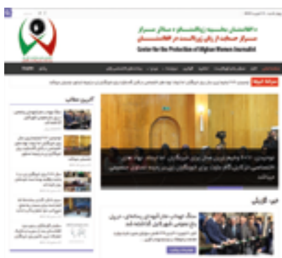
→ Homepage of the CPAWJ website

(...), around 100 women have given up being journalists because of mounting Islamist pressure.