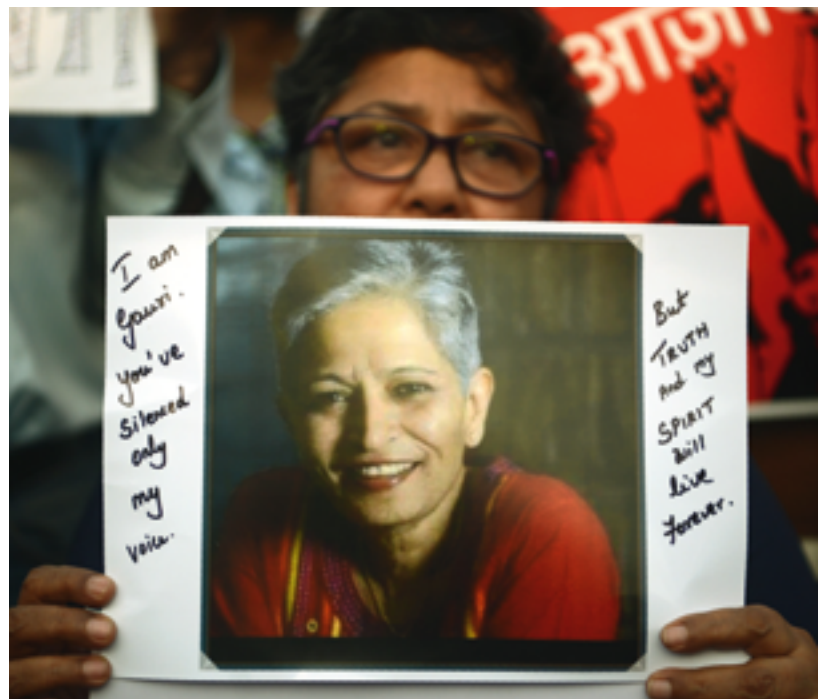
→ Mumbai on September 6, 2017. Rally condemning the killing of journalist Gauri Lankesh.