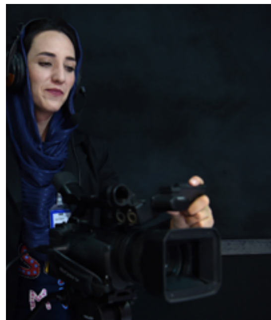
→ Kabul, Afghanistan - May 24, 2017. Afghan camerawoman from Zan TV films a morning programme at the Zan TV (Women’s TV) station