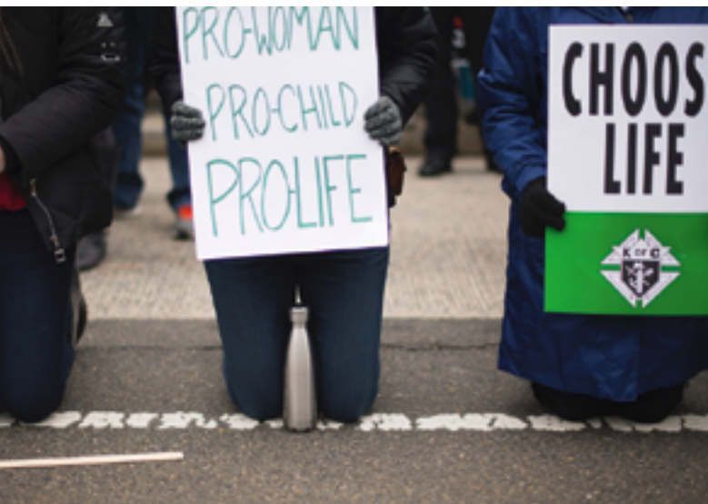
→ Pro-life activists before the Supreme Court of the United States - Washington, DC, January 22, 2017.

Covering women's issue can even prove dangerous for journalists in countries regarded as leading democracies. In the United States, for example, covering the issue of abortion is not without risk for reporters.