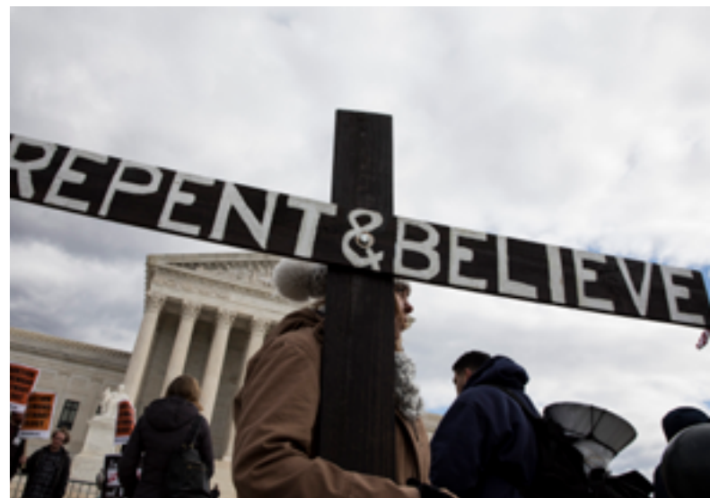
→ Pro-life activists protest outside the US Supreme Court against the 1973 decision legalizing abortion, during the 44th annual March for Life - Washington, DC, January 27, 2017.