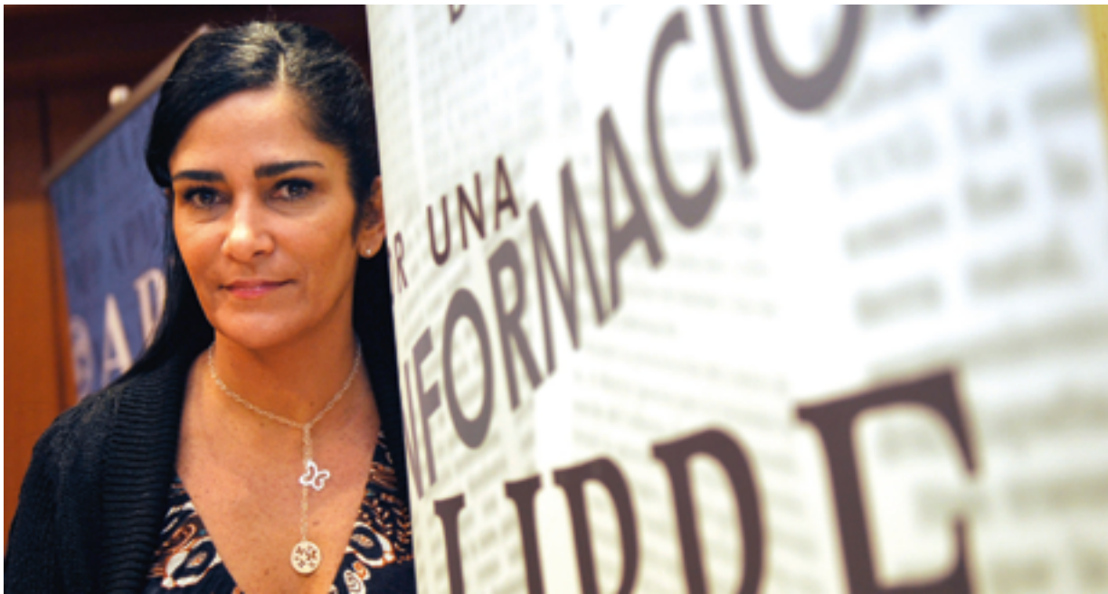
→ Mexican writer and journalist Lydia Cacho poses investigated on feminicides in Ciudad Juarez, Mexico.