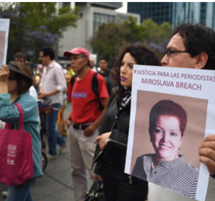
→ Mexico City, on March 25, 2017. Protest after the murder of the journalist Miroslava Breach.

The staff of Tolo News , an Afghan 24-hour TV news channel that focuses on