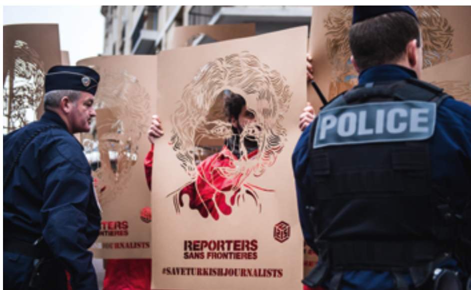
→ Demonstration of Reporters Without Borders in front of the Turkish Embassy, on January 5, 2018, to call for the release of Turkish journalists unjustly detained.

Since 2010, at least 1,571 Turkish women have been murdered by men because they were women.