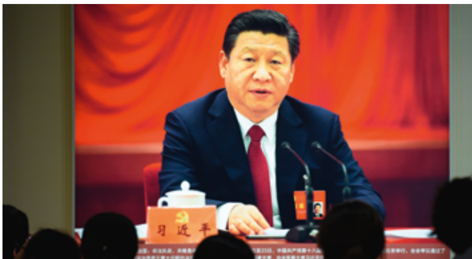
→ Chinese President Xi Jinping