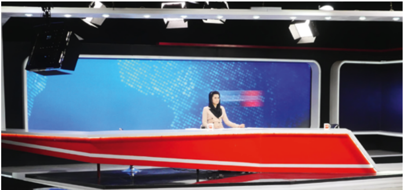
→ Studios of the Afghan private TV channel Tolo news.

"Journalists can be shot in cold blood, even when they are not in the battlefield!"