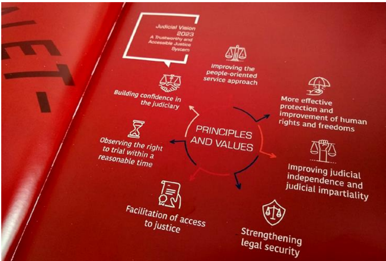
Judicial Reform Strategy published by Turkish Justice Ministry in May 2019.