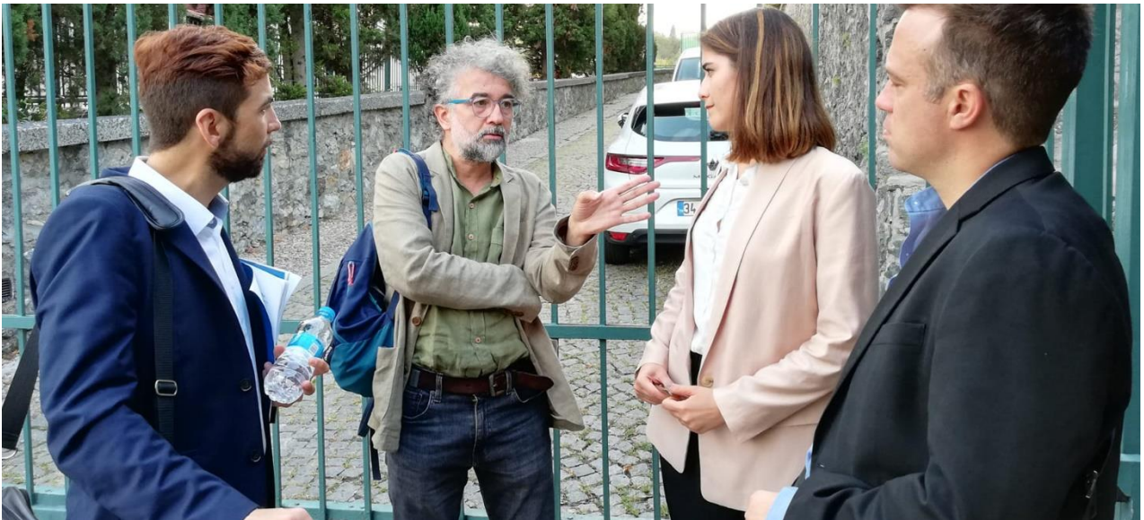
Discussion on how to react to denied request to visit jailed Cumhuriyet journalists, September 10, 2019

IPI applied for permission to visit the Cumhuriyet journalists held in Kandıra prison on the first day of the mission and the positive response of the justice ministry initially encouraged us to expect approval. However, when the decision eventually came on the eve of the planned visit we were informed that foreign nationals could not attend, and that if Turkey nationals were to apply separately permission could be granted. There was no time to re-apply and test the offer.