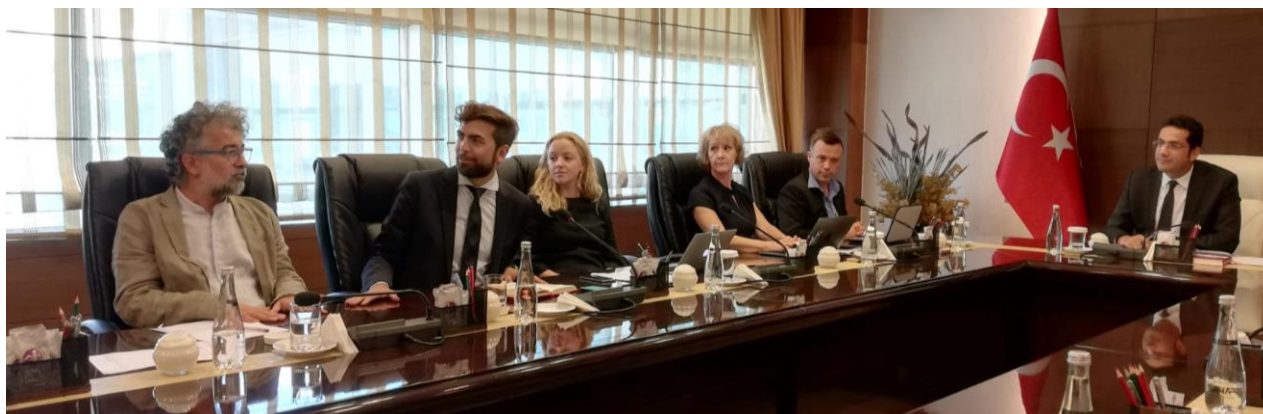
Meeting at the Turkish Constitutional Court (TCC), September 12, 2019.

The TCC's response was to insist that all the rulings were made in line with ECtHR standards and that where rulings differed it was because the evidence differed. They would not be drawn on the details of the individual cases.