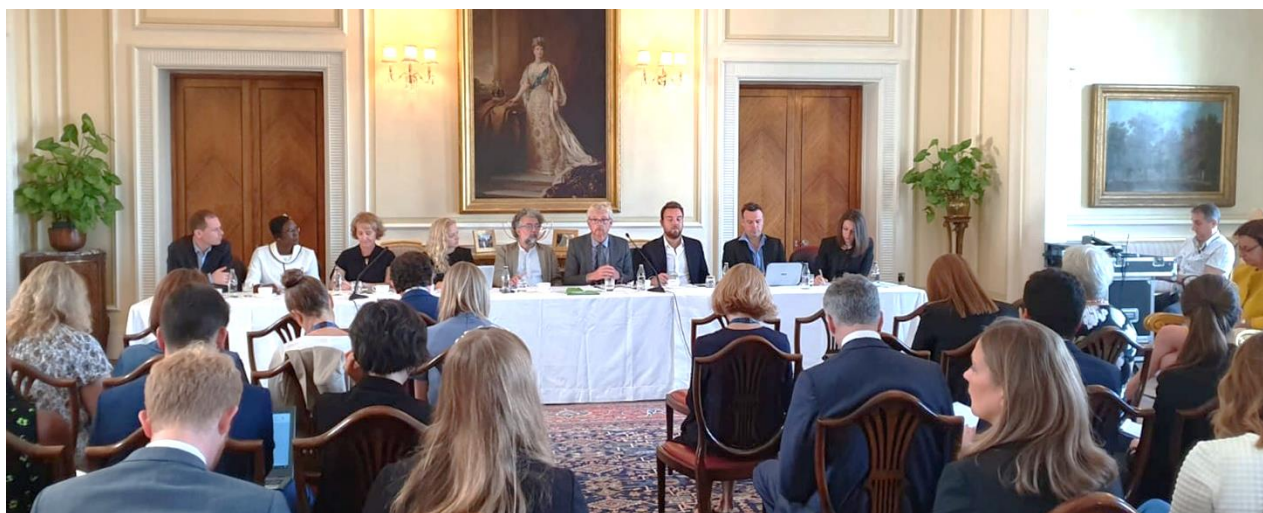
Meeting foreign diplomatic missions in Ankara, September 12, 2019.

The Delegation of the European Union in Ankara continues to monitor and assess Turkey's legal system, including trials of journalists, as part of the accession process. Its coordination of local trial monitoring by EU member state diplomatic missions is important, yet the caseload is high, given the number of journalists in detention. The EU noted the adoption of the judicial reform strategy, and the reconvening of the Reform Action Group, but has emphasized securing "tangible results" 77 . Press freedom groups have expressed concern to the Delegation (as well as other EU institutional bodies) that the judicial reform strategy could alleviate some pre-trial detention concerns, but is unlikely to actually open up the space for press freedom.