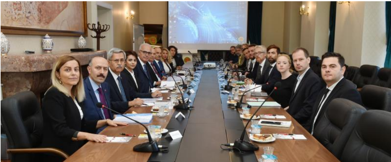
Meeting at the Supreme Court of Cassation (SCC), September 13, 2019.

During the international mission's three meetings with the Ministry of Justice, the TCC and the Supreme Court of Cassation (SCC), we raised concerns about the arbitrary detention of at least 200 journalists since July 2016 and the judiciary's role in the sentencing of journalists on terror-related charges solely on the basis of their reporting.