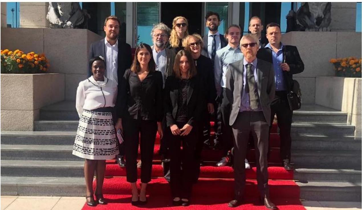
International press freedom delegation, September 12, 2019.

The delegation is concerned about the system of issuing press cards, which has been taken over by the presidential office and is profoundly affecting the capacity of national and international media to operate in the country.