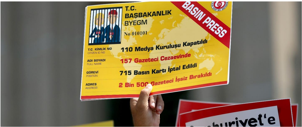
People hold symbolic press cards during a rally in front of the Istanbul Courthouse, July 28, 2017.