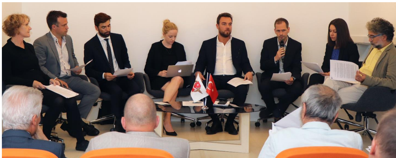
Press conference at Ankara Journalists Association, September 13, 2019.

The mission concluded with a press conference hosted by the Ankara Journalists' Association where it issued the following statement: