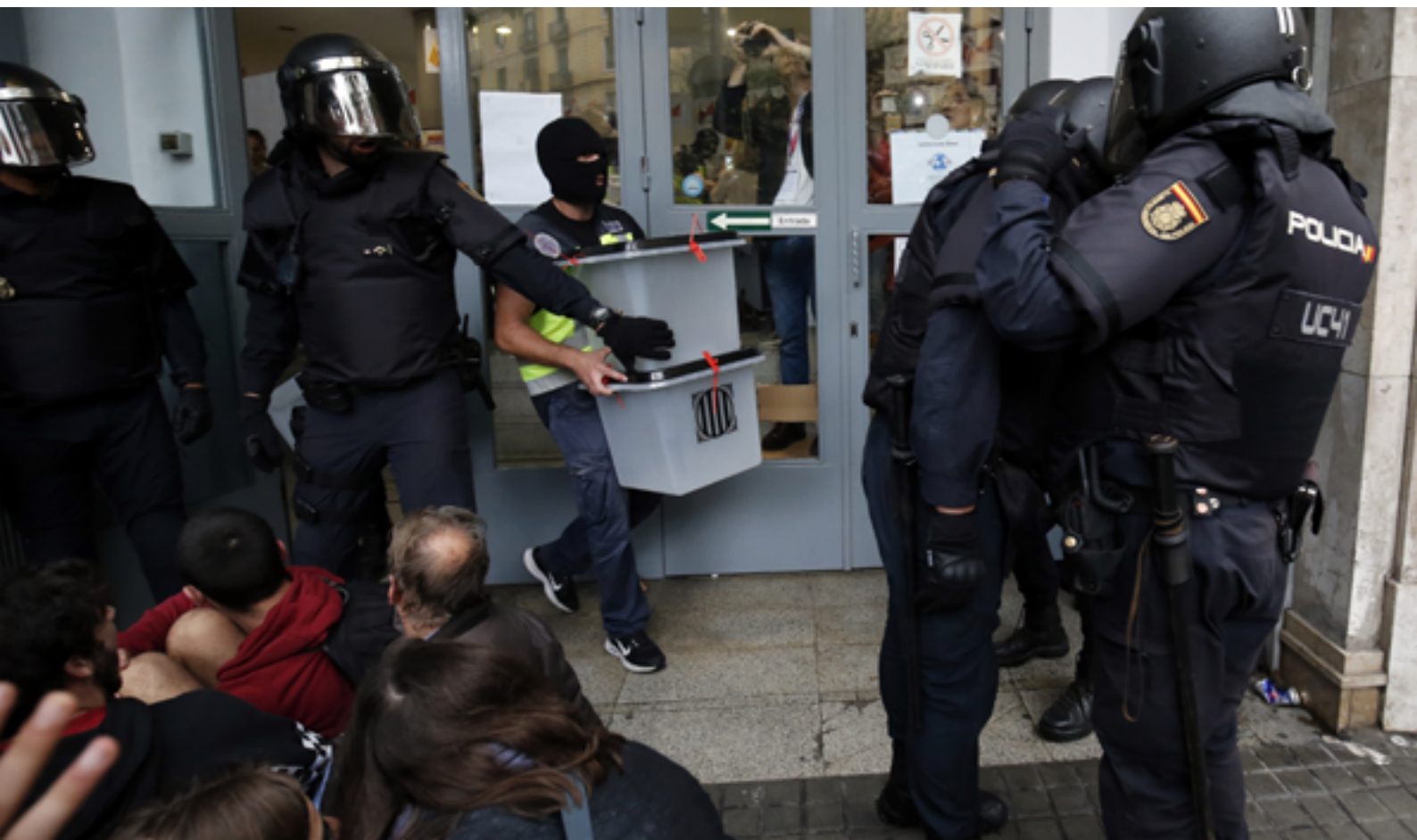
→ Spanish police seize ballot boxes in a polling station in Barcelona