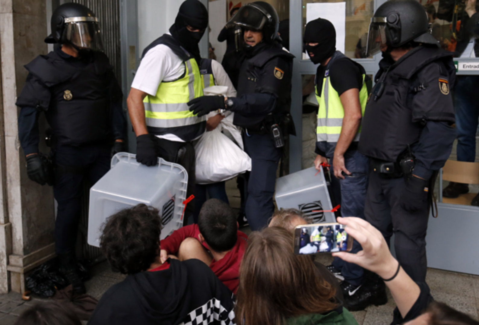
→ Spanish police officers seize ballot-boxes in a polling station in Barcelona